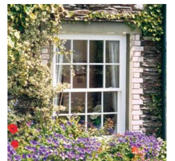
1 Acryl II colouring system